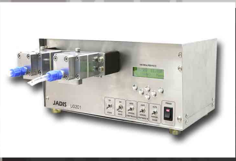
Micro computer base controller with LCD display.