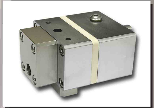
Adjustable speed precision gear pump.